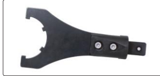
type UM (optional)