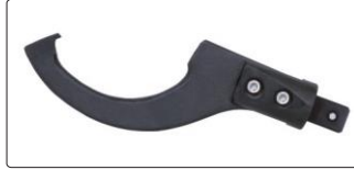
type C (optional)